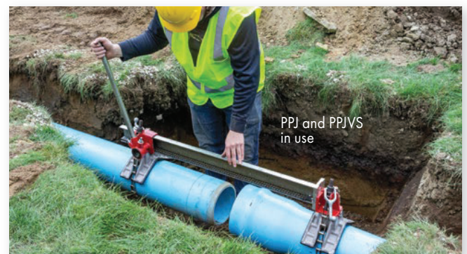
PPJ and PPJVS in use