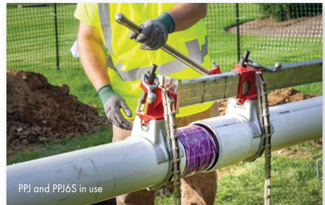
PPJ and PPJ6S in use

NOTE: Fitting attachment (PPJFA) and saddles sold separately from PPJ.